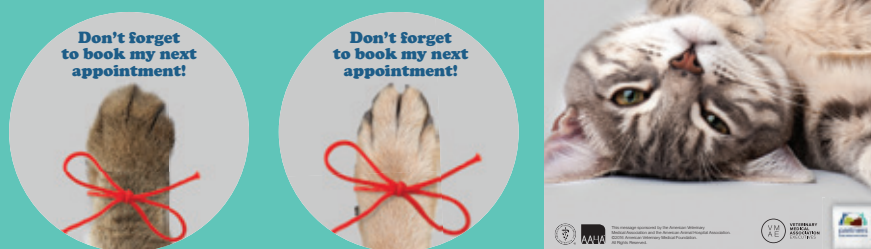
FIGURE 1 —Forward booking reminder buttons can be ordered free of charge (25 buttons or less) from the Partners for Healthy Pets website.