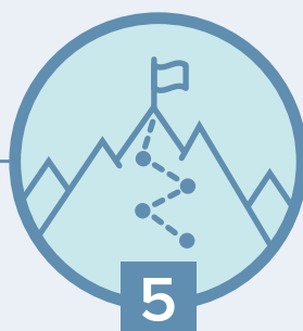
5 Outline Story