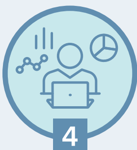
4 Gather Data