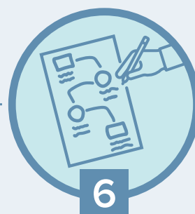
6 Create Concept