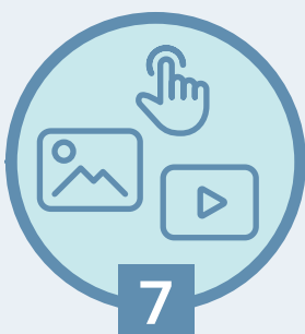
7 Identify Interactivity