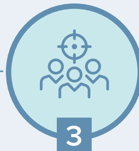
3 Identify Audience