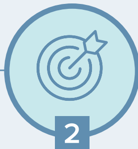
2 Identify Goal