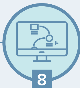
8 Execute Concept