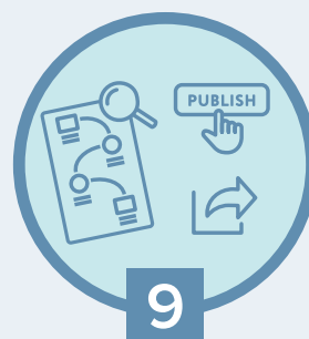
9 Proof, Publish and Share