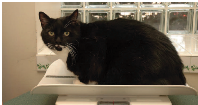
Figure 2 —Regular assessment of weight and body condition score is important in cats of all ages—and this needs to be stressed to owners. Expressing any changes in weight as a percentage, or in terms of an equivalent weight loss/gain in humans, can be helpful.

Energy and nutrient needs vary with life stage, sterilization status and activity, and so general feeding recommendations provide only a starting point. Individual intakes must then be adjusted to maintain the desired weight and body condition score (Fig. 2).