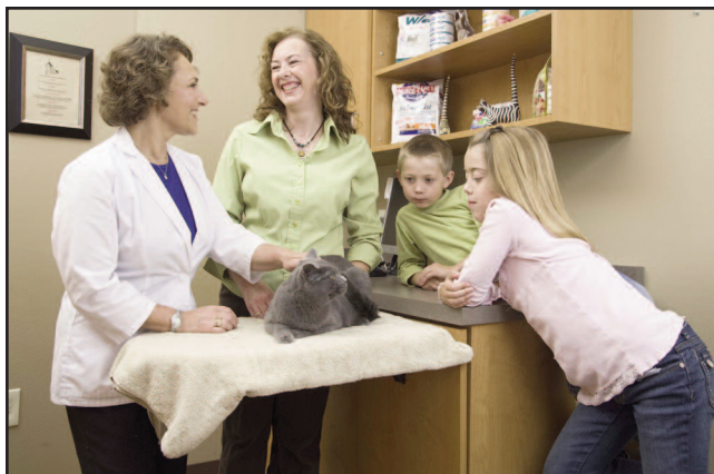
Figure 1 —The benefits of regular wellness exams often are not immediately apparent to pet owners and need to be well explained.

The reasons pet owners have cited for not seeking care were that they did not know it was necessary, the veterinarian did not recommend it, and the need or benefit was not well explained. 7 Other obstacles include the cat's stress or fear associated with veterinary visits and the practical difficulties of transporting cats to receive veterinary care. Suggestions for overcoming such barriers are provided on page 77.